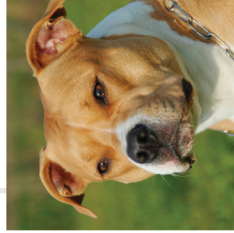
American pit bull terrier