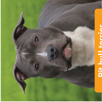
Pit bull terrier