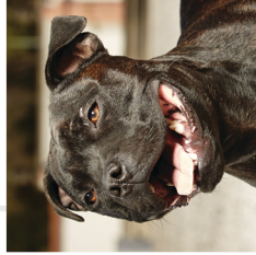
Staffordshire bull terrier